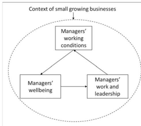
Figure 1. Conceptual framework of the thesis.

The key elements of this thesis are the work, working conditions, and wellbeing of managers in small growing companies (Figure 1). These elements are decisive for occupational health in small companies and are related to each other and their specific context. Managers' work (comprising managerial work activities and leadership behaviours) has an impact on managers' working conditions. Managers' working conditions are important for managers' wellbeing, which in turn affects their work. All these factors are context-sensitive, and more knowledge is needed to elucidate how managers' work, working conditions and wellbeing, as well as the mutual relationship between these, are actualized in the specific organizational context of small growing companies.